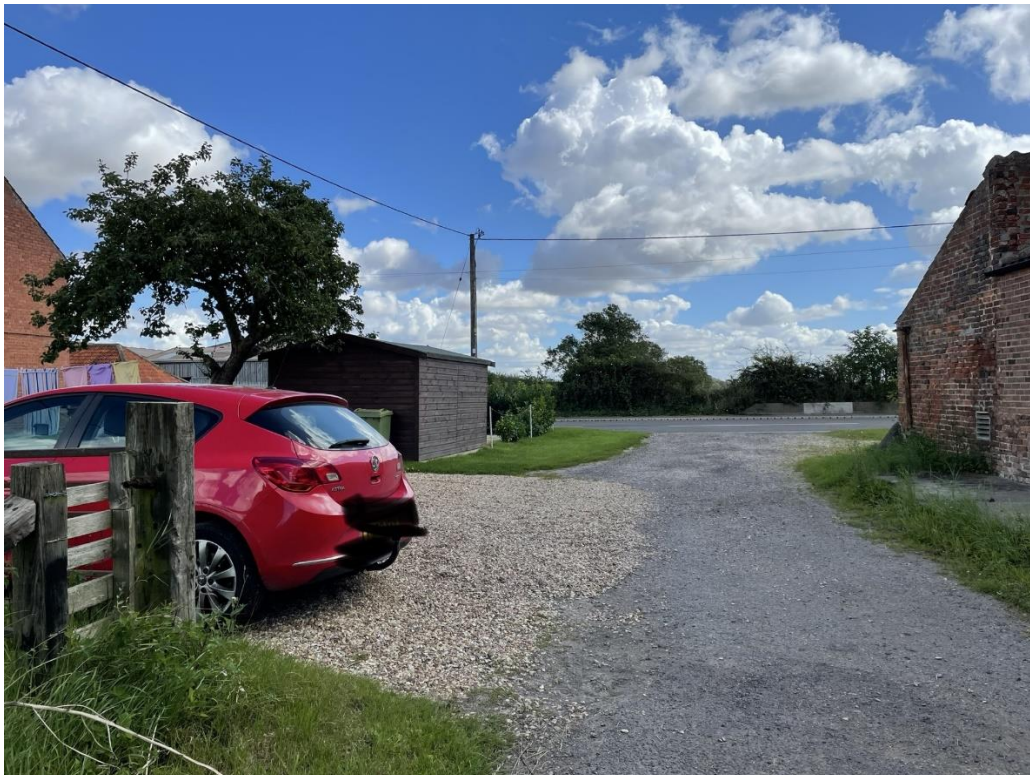
Image 4: View East towards B1241, again showing the close proximity to houses and access routes and driveways to houses that will be affected by the works.