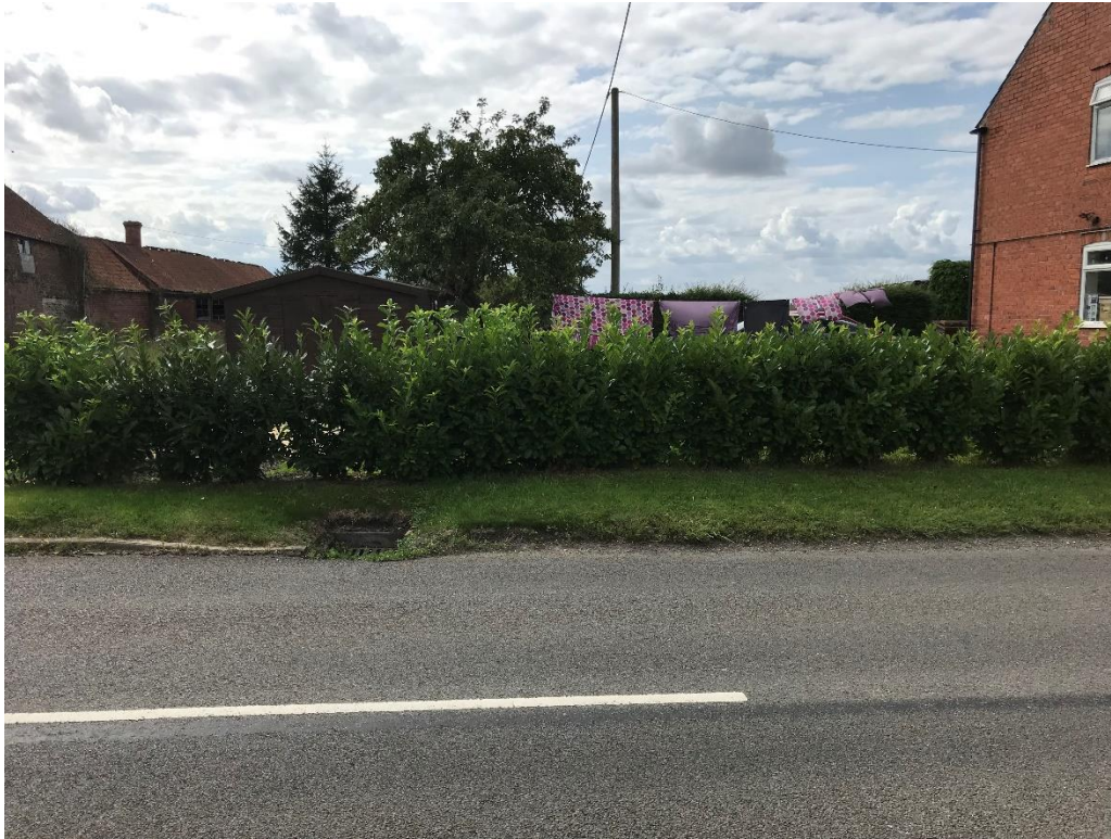
Image 3: Garden of 1 West Farm Cottages, that is included in the proposed cable route, showing how the cable will pass in close proximity to houses.