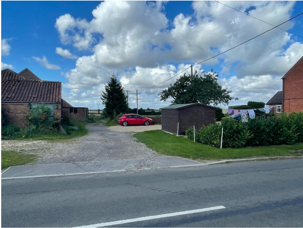
Image 1: 1 West Farm Cottages on the right, view from B1241 looking West, showing the narrow gap between the buildings.