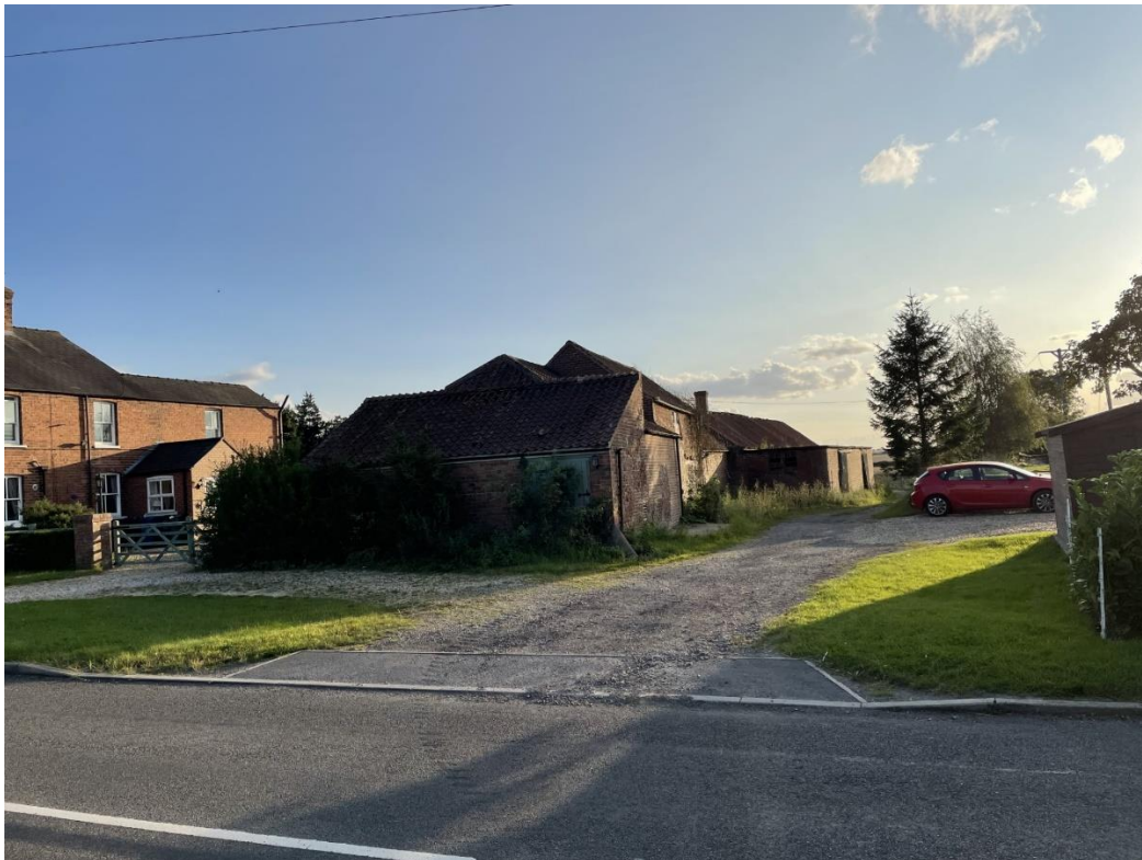
Image 2: West Farm, view from B1241 looking West, with barns at the rear of the picture to be converted to houses.